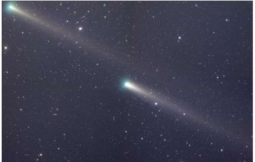
Two fragments (B and C) of comet 73/P Schwassmann-Wachmann imaged from Namibia. 8" f/3.8

More of Wolfgang Promper's pictures can be seen at http://www.astro-pics.com and more of Gerald Rhemann's images can be seen at http://www.astrostudio.at