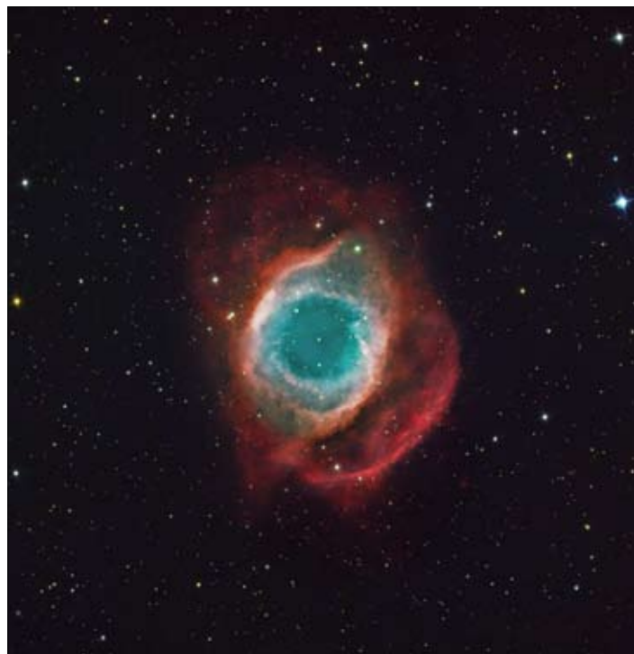
Left: NGC7293, the Helix Nebula showing seldom imaged detail. 12" f/3.8 HaRGB of 120/20/20/30 minute exposures.