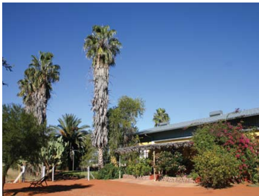
Astrofarm Tivoli is a green oasis in the midst of undulating yellow grass.